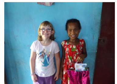
GIFTS FOR CHILDREN